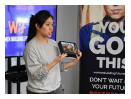
Invited to participate in the Gender Equality Network Canada, a unique three-year initiative to advance gender equality in Canada, hosted by the Canadian Women's Foundation.