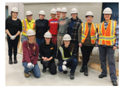
Building on the momentum of our inclusive workplace research, we were invited to partner on a construction readiness training program expanded to BC through LNG Canada Project.