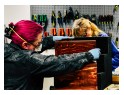
Approached to partner on major projects in Alberta Heartland & Northern Alberta to support training and hiring local women.