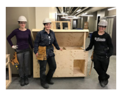
Students supported Zoe's Animal Rescue by building doghouses for families in need.