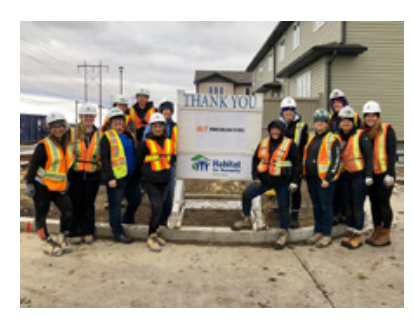
WBF team laced up steel toe boots to support building homes for Habitat for Humanity.